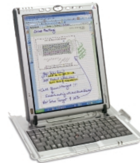
M1400 with Hardtop Keyboard.

Equipped with high-capacity lithium ion batteries, the M1400 is designed to keep up with the demands of your day by providing long battery life, quick charge times and warm-swapping capability. LED battery gauges give you instant information regarding your remaining battery life. Motion's innovative features and design make mobile computing effortless – on the road, in the office and everywhere in between.