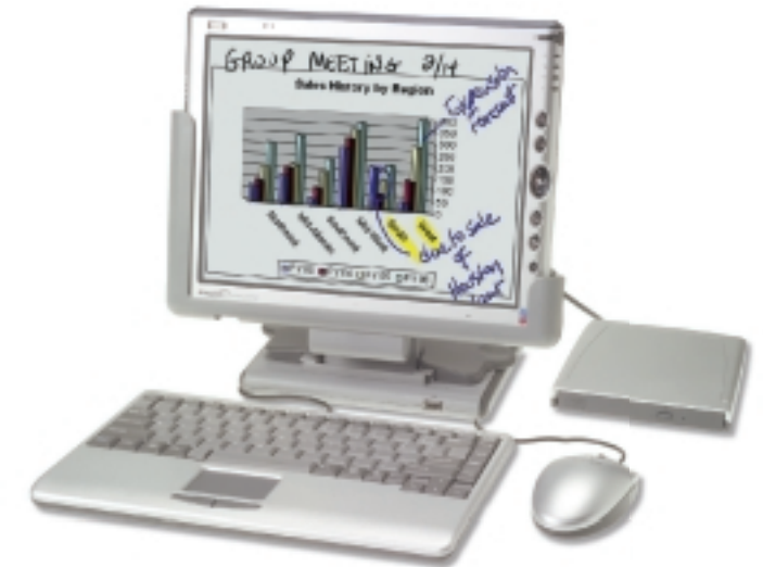
M1400 with FlexDock, DVD and USB Mobile Keyboard.

Used as a slate when mobile or in full-function desktop mode with a keyboard and wide array of accessories when docked, the M1400 facilitates every type of work scenario. And simple, one-handed grab-and-go docking makes it easy to switch between work environments without interruption.