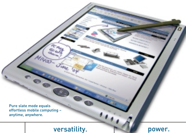
Pure slate mode equals effortless mobile computing - anytime, anywhere.

Motion Computing's award-winning M1400 Tablet PC product family offers unique, innovative technologies that advance Tablet PC computing to a new level. With Intel® Centrino™ Mobile Technology or Intel Celeron® M technology, high-speed wireless connectivity and outstanding battery performance, Motion M1400 Tablet PCs bring mobility, versatility and power to everywhere you work today.