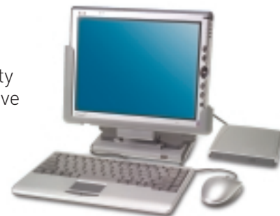
Grab-and-go docking: switch between work environments without interruption.

Enhanced Security: Motion M1400s feature an integrated fingerprint reader and security software that protects sensitive data, prevents unauthorized access to network resources and provides convenient, single-step, global password management.