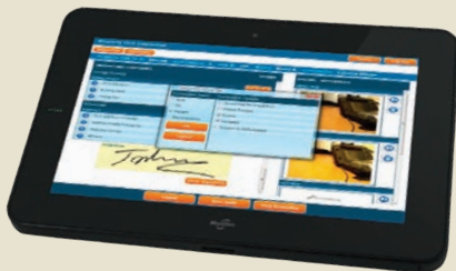
Ultra-light Rugged CL900 Tablet PC