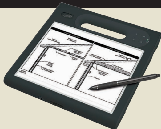
Integrated, Powerful and Portable Rugged F5v Tablet PC