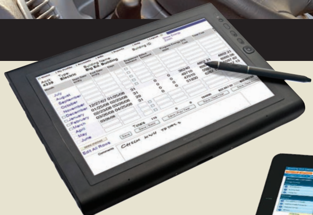
Powerful, Full-featured Rugged J3500 Tablet PC