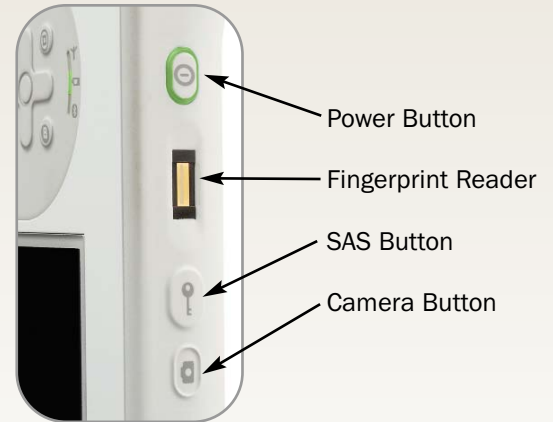
Top Right Corner (side view)